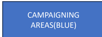
CAMPAIGNING AREAS(BLUE) DESIGNATES WHERE CAMPAIGNERS, SIGNS AND GENERAL CAMPAIGNING SHOULD TAKE PLACE