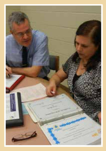
Workshops on resume, interviewing tips, and job searching skills were offered in conjunction with the Fair.