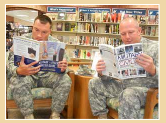
The library is working to assist in transitioning from the military to civilian careers.

1,500 job seekers had the opportunity to speak with over 20 companies and educational institutions.