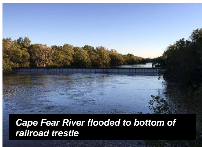
Cape Fear River flooded to bottom of railroad trestle