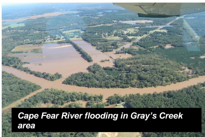
Cape Fear River flooding in Gray's Creek area