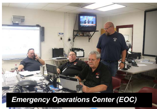
Emergency Operations Center (EOC)