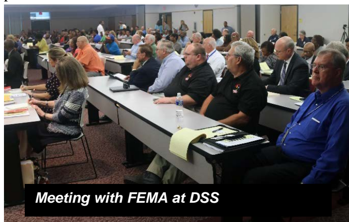
Meeting with FEMA at DSS

Solid Waste helped manage the pick-up and disposal of storm debris in the unincorporated areas of the county. The County contracted with two companies for debris-related services. Ceres Environmental Services was hired to remove debris and haul it to the appropriate landfill. Landfall Strategies was hired to manage and monitor the process.