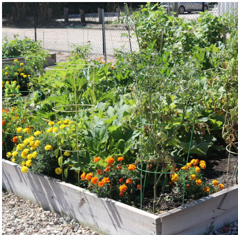
Dwaine Goings of Facilities and Maintenance is growing watermelons, corn and okra.

The County Employee Garden is lush with fruits, vegetables and flowers grown by employees. It's hard to miss the garden on Kennedy Street, with its bounty of corn, squash, pepper and watermelon plants.