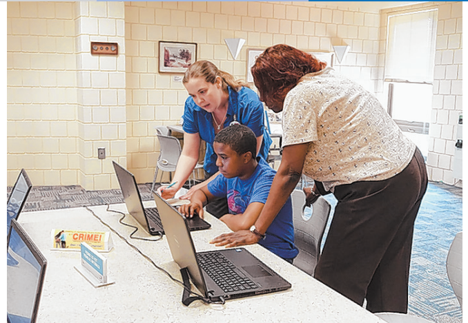
Youth explores careers and learns how to search online for jobs.

♥ We had a lot of teens who were interested in financial literacy. Many left contact information so they could learn more. ♥ –Action Pathways