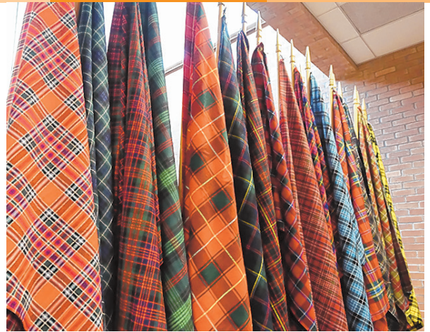
Colorful tartans on display at the Scottish Heritage Festival.

A library customer learned how to use the NVDA (NonVisual Desktop Access) screen reader software and computer basics from a library staff member. After a couple of sessions, the student successfully typed seven sentences and then used commands to read what she had typed: