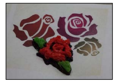
Let's Do a Science: STEM: 3D pens – Teens experimented with "creating something from nothing" with 3D printing pens.