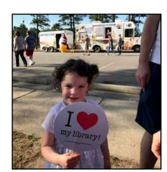
Everyone had a blast at the Hope Mills Food Truck Rodeo

the library and its resources made it possible for her to succeed. While proudly showing her graduation cap she teared up and said, "I had wanted to just quit, but being able to reserve a place for my studies and getting help and encouragement when I needed it from you all just made all the difference in my life!"