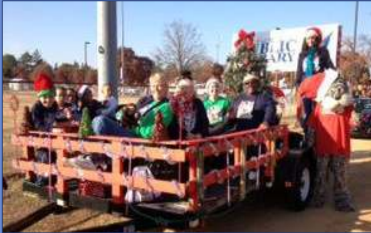
Hope Mills Christmas Parade on Dec. 1