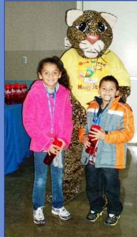
FireAntz Hockey Game Nov. 24