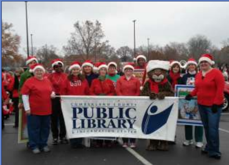
Fayetteville Rotary Christmas Parade Dec. 8